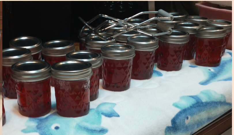
Red Pepper Jelly

So, come on down and indulge in the fruits of our mango hunt labor. It's not just about the jam and jelly; it's about the memories, the laughter, and the sense of community that fills our hearts. Together, we've turned a challenging situation into a joyous occasion, and we can't wait to share these delightful treats with all of you!