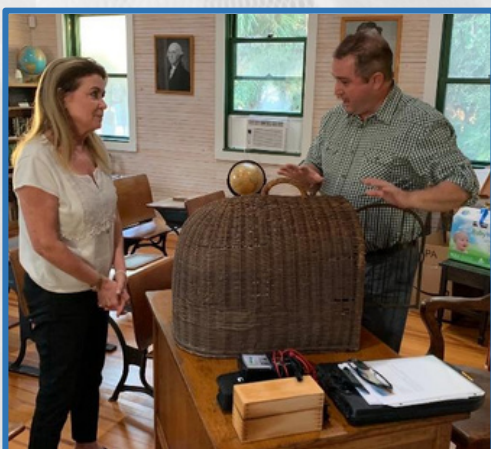
Participants gain valuable information about their antiques and collectibles.

Register in Advance at EsteroHistoricalSociety.com