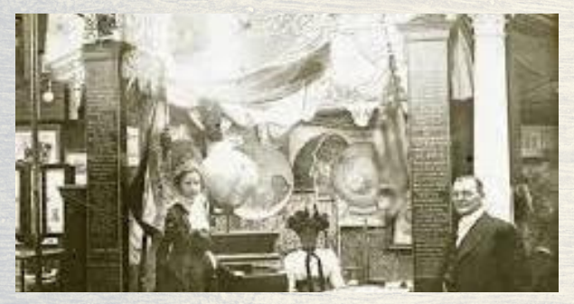
Cyrus Teed with the Koreshan exhibit at 1901's Pan American Exposition in New York.