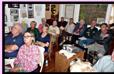
Guests Listening to Speaker