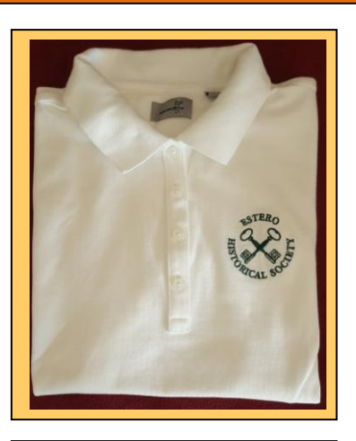
NEW!! Embroidered Golf Shirts with the EHS Logo available in a variety of colors and sizes.

We offer a collection of Historical Books some written by descendants of these incredible Pioneering families of Estero. We offer a complete "Book Review" on our website. Go to EsteroHistoricalSociety.com then click on "Shop EHS" then "Books".