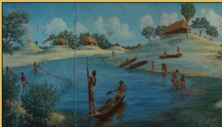
Calusa Indians on Mound Key

We hope you will join us at our upcoming events!