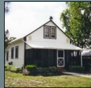
It's original location on Highlands Ave.