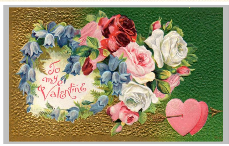
Antique Valentine's Day Card's which will be on display at our February 8 th meeting. If you have any you would like to contribute bring them with you!