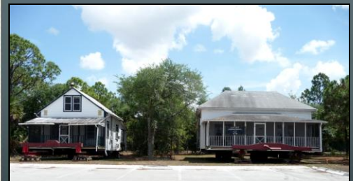
Schoolhouse and Cottage sitting in their new spot which will be their permanent home so that restoration may begin on both historic buildings.

WE HAVE COMMITTEES... NOW WE NEED VOLUNTEERS! WE NEED YOU!!