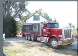
Loaded up and heading for the Estero Community Park.