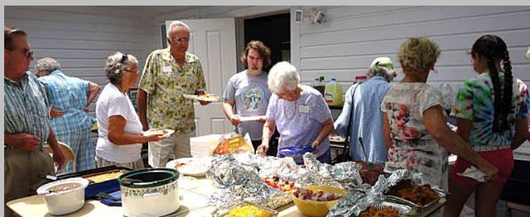
Our Annual Pioneer Picnic of 2014

If you have ever been to one of our picnics, then you know it is a lot of fun catching up on the stories from back in the day with our pioneer families. When everyone gets together it's like we are one big family. We ask that you bring a covered dish and a dessert of your choosing, table service and beverages (non-alcoholic) for your party. More info will be coming soon...SAVE THE DATE!!