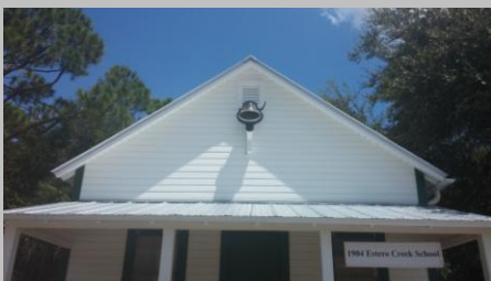
Under the schoolhouse bell is where the new sign will be located