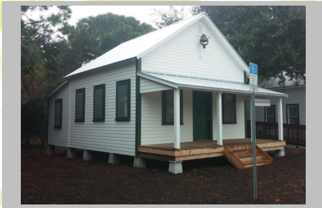
1904 Estero Creek Schoolhouse