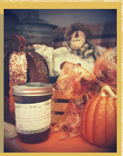
Mango Jam and Surinam Cherry Jelly are available in ½ pint jars for $5.00.