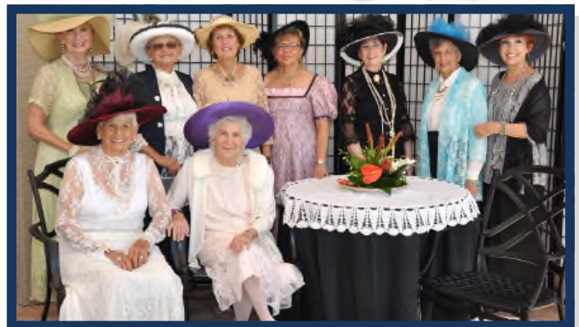
Featured picture this issue from "Lace".