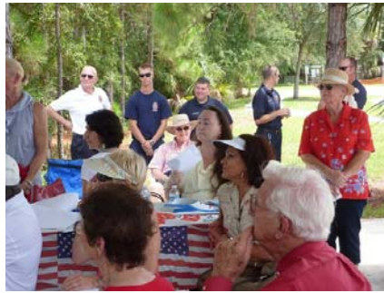
Estero Fire Rescue has become a large part of the days events.