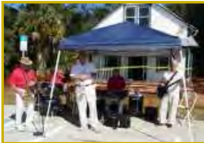
The Brooks Brothers