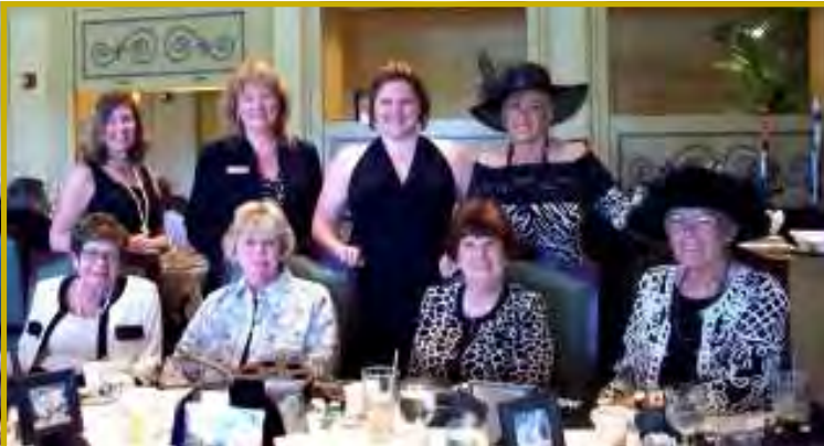
Ladies at the tea dressed in black and white.