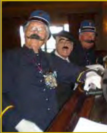
Keystone Cops and Charlie